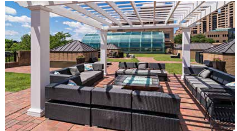
Newly renovated rooftop deck with city views

For additional information and availability: