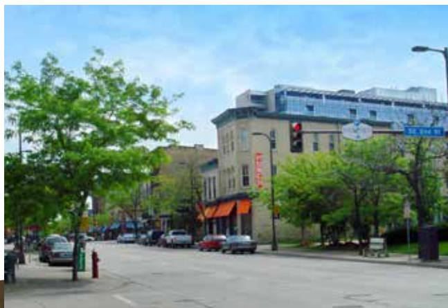
Historic charm and authenticity of Northeast neighborhood