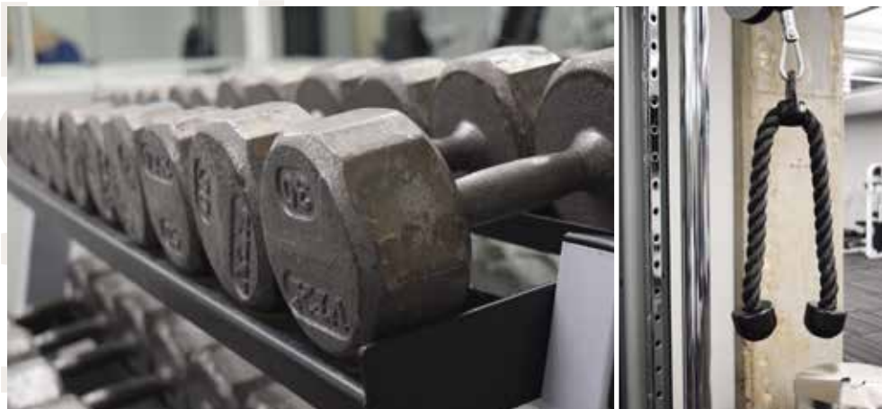
Wide array of weights