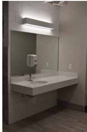
Sink and countertop space for maximum use