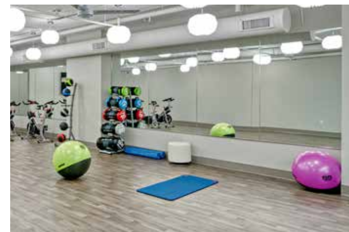
Floor exercise room

For additional information and availability :