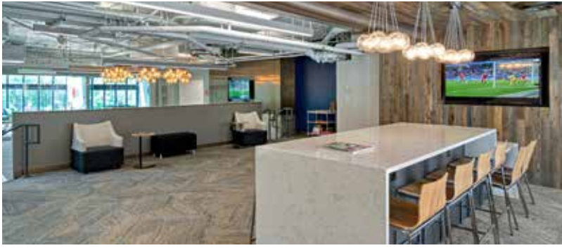
Collaborative work areas with abundant natural light