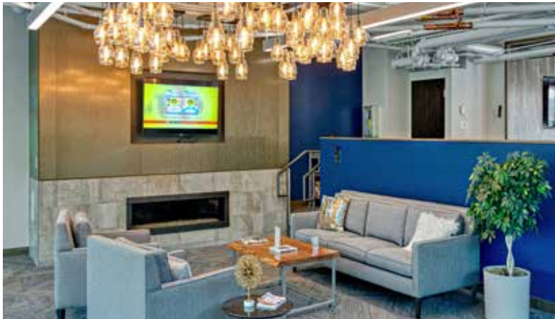
Upgraded tenant lounge with fireplace