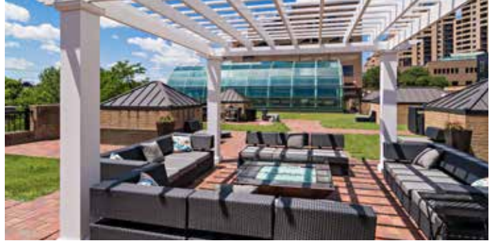
Newly renovated rooftop deck with city views

Significant capital improvements have been designed to enhance Riverplace's sense of community and engage the modern workforce.