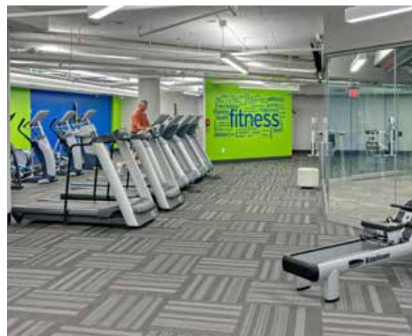
Ellipticals, treadmills, and stationary bicycles