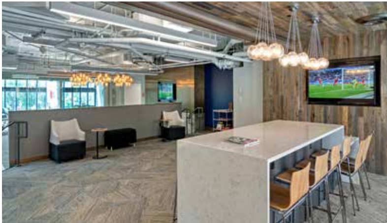
Collaborative work areas with abundant natural light