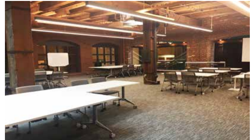
Spacious conference and training rooms