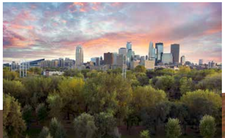
Panoramic views with convenient access to downtown Minneapolis