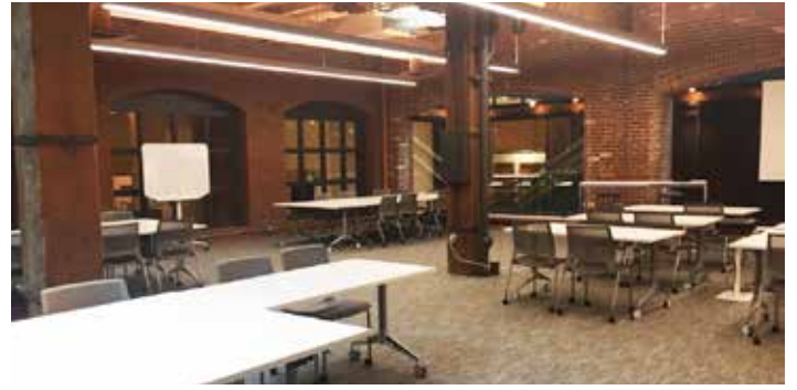
Spacious conference and training rooms