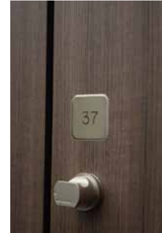
Plenty of lockers in both men's and women's locker rooms