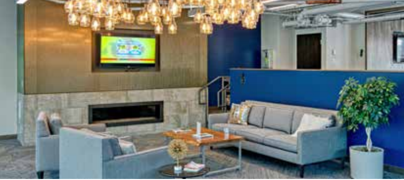
Upgraded tenant lounge with fireplace